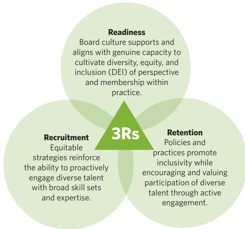
FIGURE 1. READINESS, RECRUITMENT, AND RETENTION IN PRACTICE (3RS)

The 3Rs guided the development of the strategic framework for evaluating green board readiness, recruitment strategies, and retention efforts to engage and sustain Black talent. Simultaneously, cultivation of more equitable and inclusive environmental and conservation leadership with informed and intentional practices may empower those committed to progressing the environmental and conservation movement with the result of greater impact. The intention of this body of research is to be additive and supportive of work that is concurrently being done by others in the field to create more equitable and inclusive organizations while including the voices of those most often impacted by environmental racism. The theory of change for this approach is illustrated below (Figure 2).