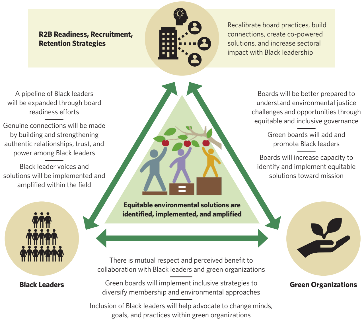
FIGURE 2. RACE TO THE BOARD THEORY OF CHANGE